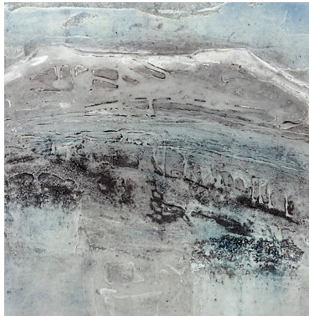
Peaks I, collographs, 2018