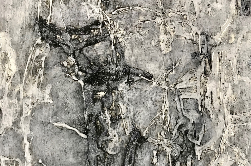
Melting Point I, Collograph, 2018

Tampa International Airport + Partners are pleased to present the works of