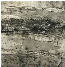
Runic series, collographs, 2018

For more information visit www.elva.is or email elvahre@vortex.is .